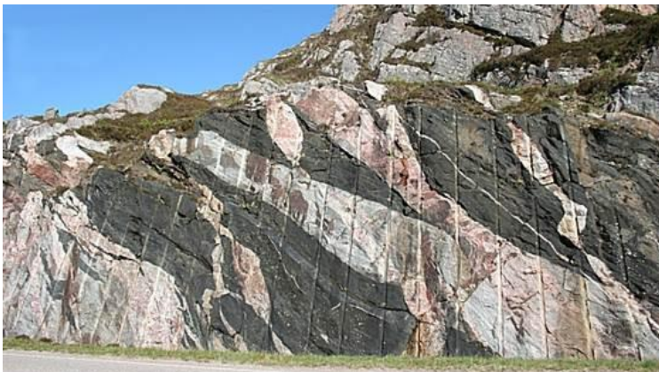
The events of two billion years encapsulated in a dramatic roadside exposure at Laxford Bridge in Sutherland

Tuesday 3 rd February, Geology of Scotland: Now we have the Lewisian basement to the north west of Scotland, what happens next – to be precise, in the next two billion years! The Lewisian terrain is still there, but it seems to be a lone wanderer next to the enormous supercontinent of Laurentia, from which it possibly broke away, though Greenland is nearby as well. It survived those two billion years, leaving some evidence of interesting events until we arrive at Torridonian times. Then so much else starts to happen that it will take this session and part of the next to cover it all.