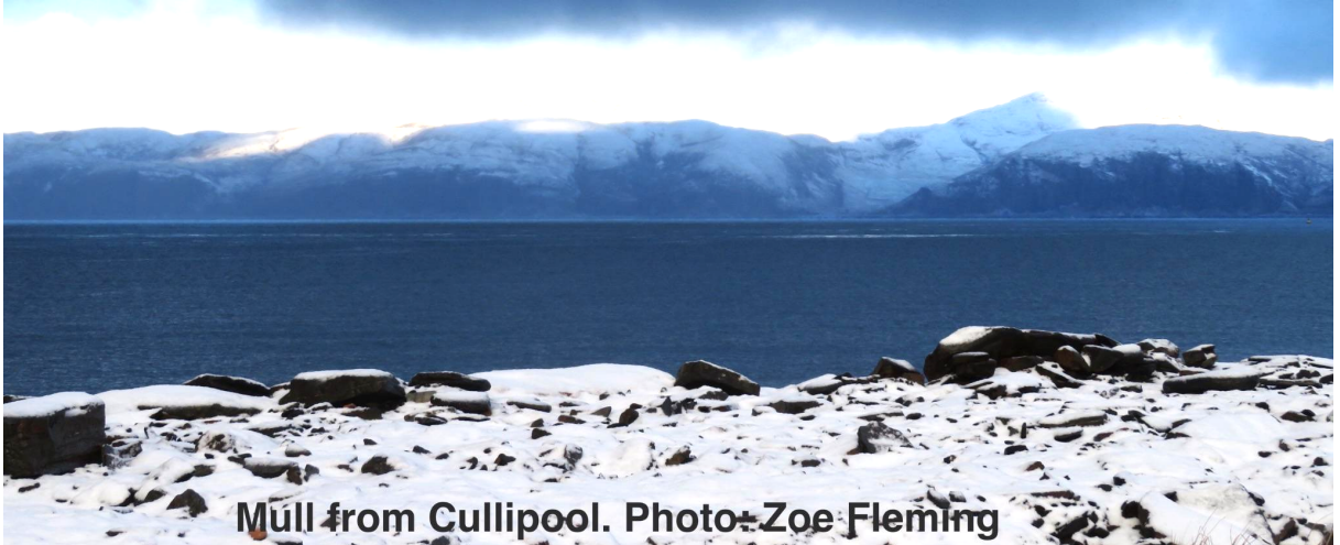
Mull from Cullipool.