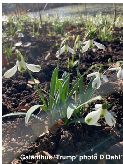
Galanthus 'Trump'