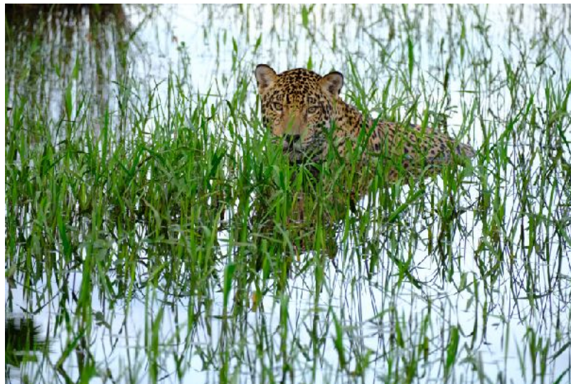
Pantanal Wetlands jaguar. Not to be confused with the Oban puma! https://www.obantimes.co.uk/2020/08/10/have-you-seen-obans-big-cat/

The brave amongst the group may be happy to climb to the very top of Battleship Hill, but there are lots of lovely views along the way. If you don't want to scramble up to the top of the hill, I suggest you bring a large carrier bag (shopping bag) or something similar to sit on whilst the hill party climb the last section.